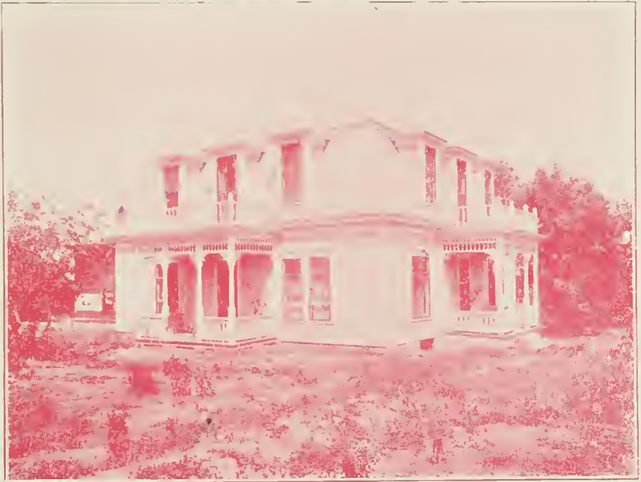
Residence of Fred Engwall, Beaver Township.